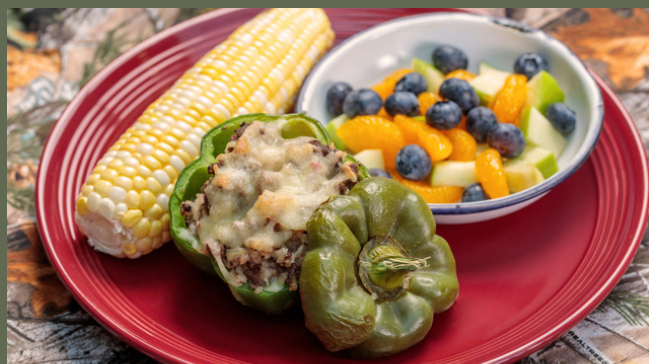
Source: Cook Wild Kentucky Project Servings: 6 Serving Size: 1 stuffed pepper

280 calories; 9g total fat; 3.5g saturated fat; 0g trans fat; 75mg cholesterol; 380mg sodium; 25g carbohydrate; 4g dietary fiber; 9g total sugars